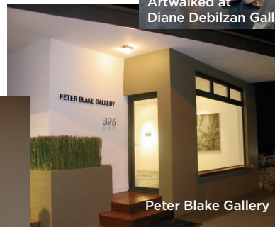
Peter Blake Gallery