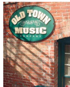
OLD TOWN MUSIC COMPANY